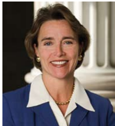
Senator Blanche Lincoln

would provide assistance when farmers need it." The University of Arkansas's Division of Agriculture released a report estimating Arkansas crop losses for the 2009 harvest have risen to more than $300 million.